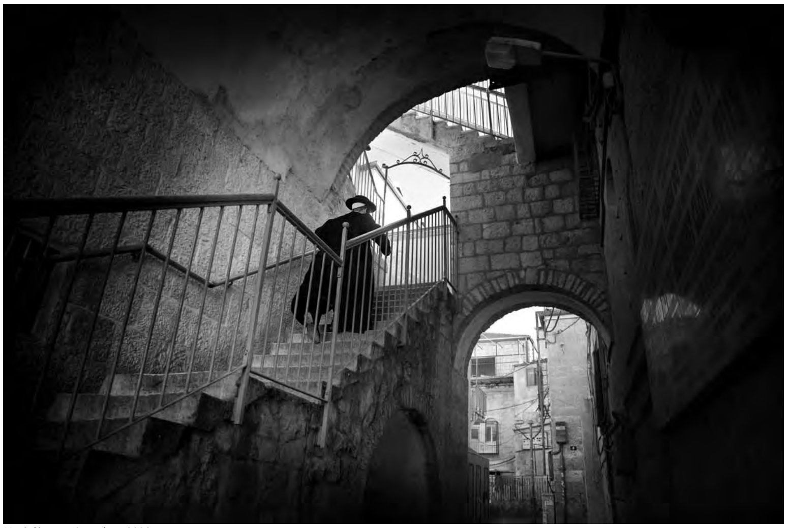
Meah Shearim, Jerusalem, 2008