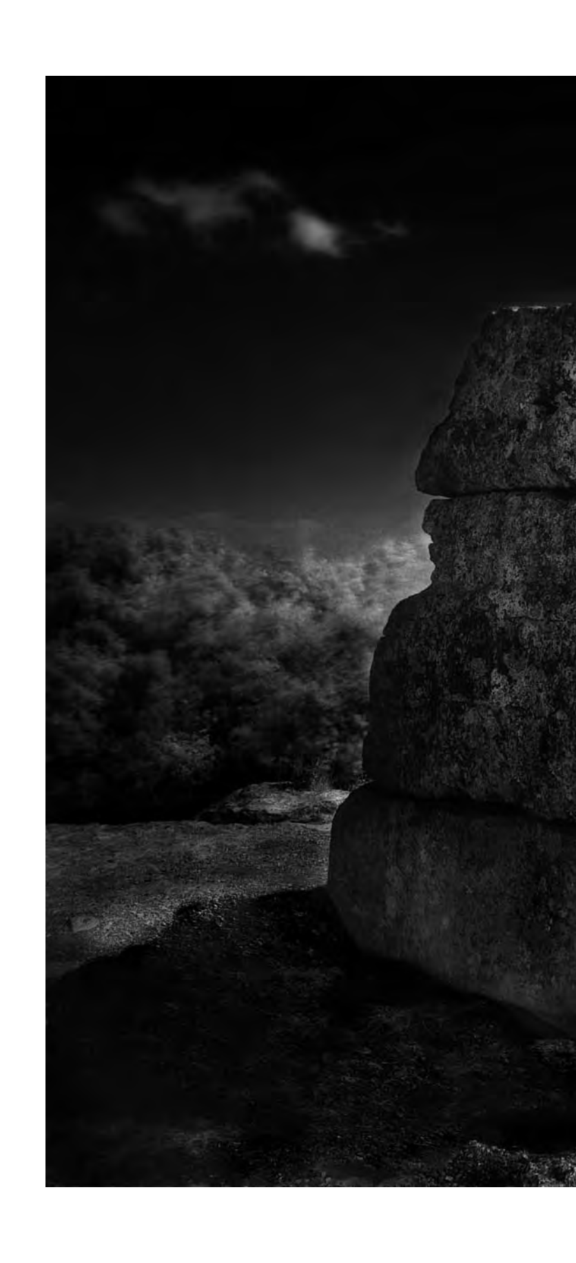
GEMINI - THE MONTH OF SIVAN