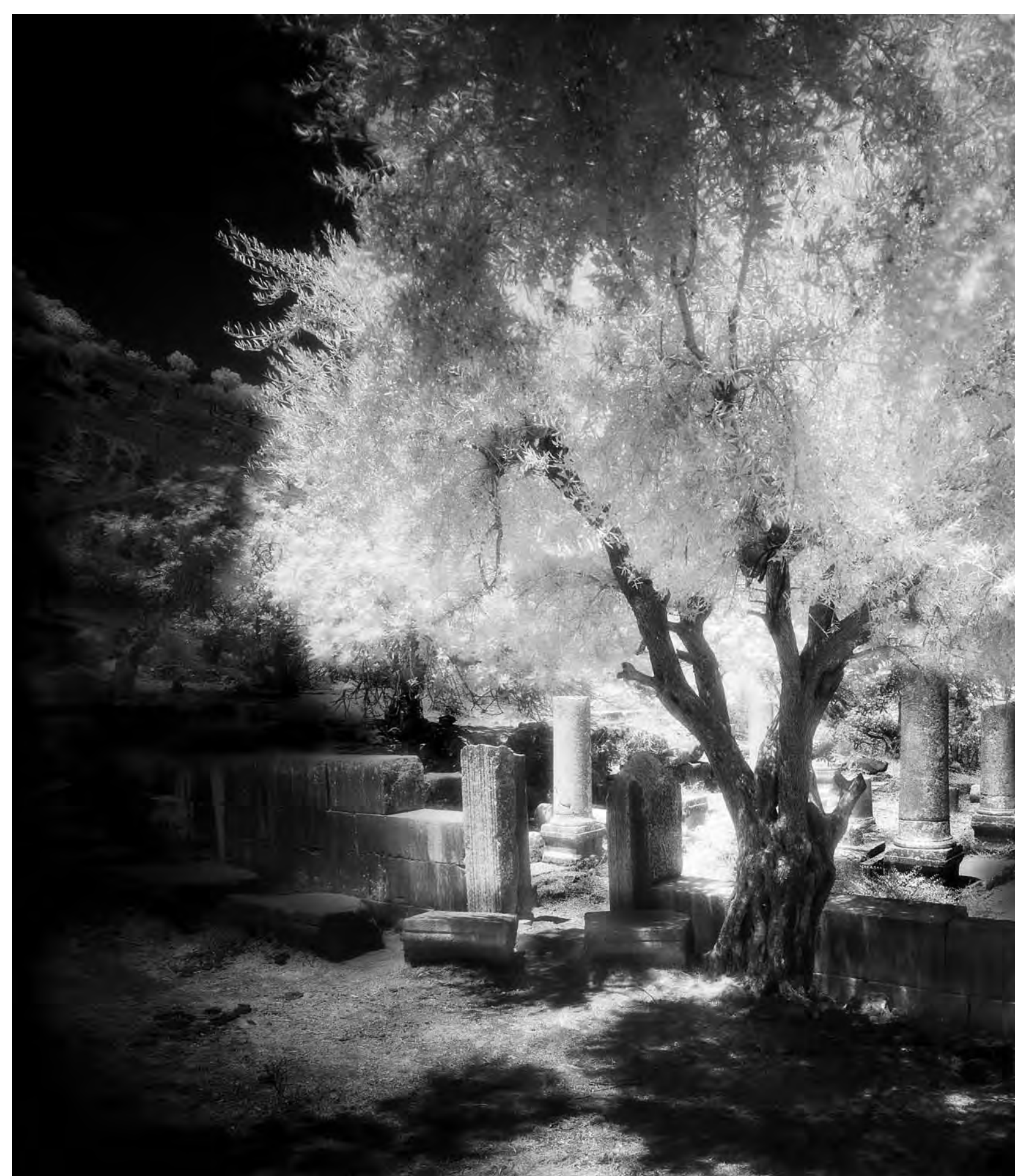
Ancient Synagogue, Gush Chalav, 2004