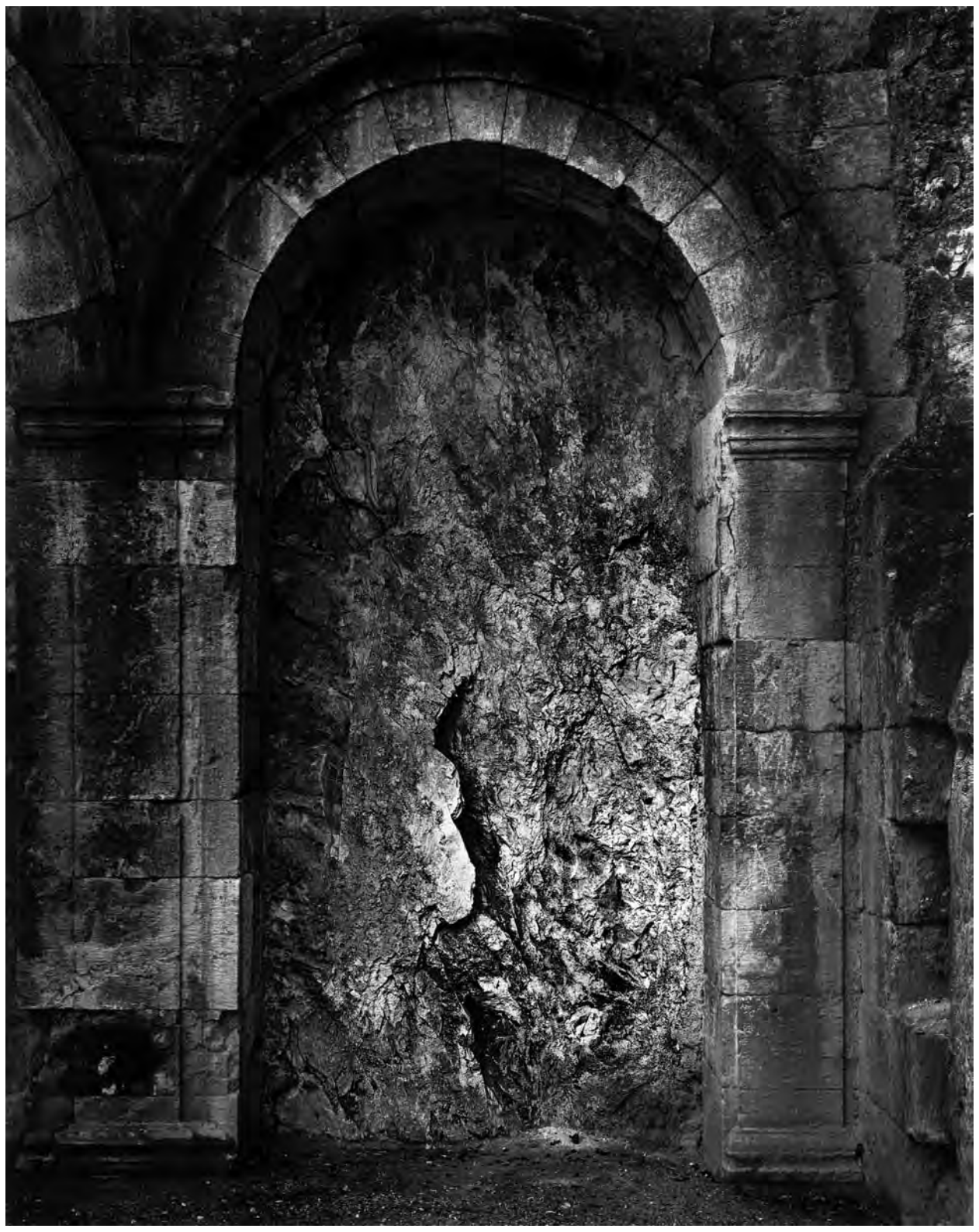
The Tomb of Rebbe Yehuda HaNasi, Beit Shearim, 2003