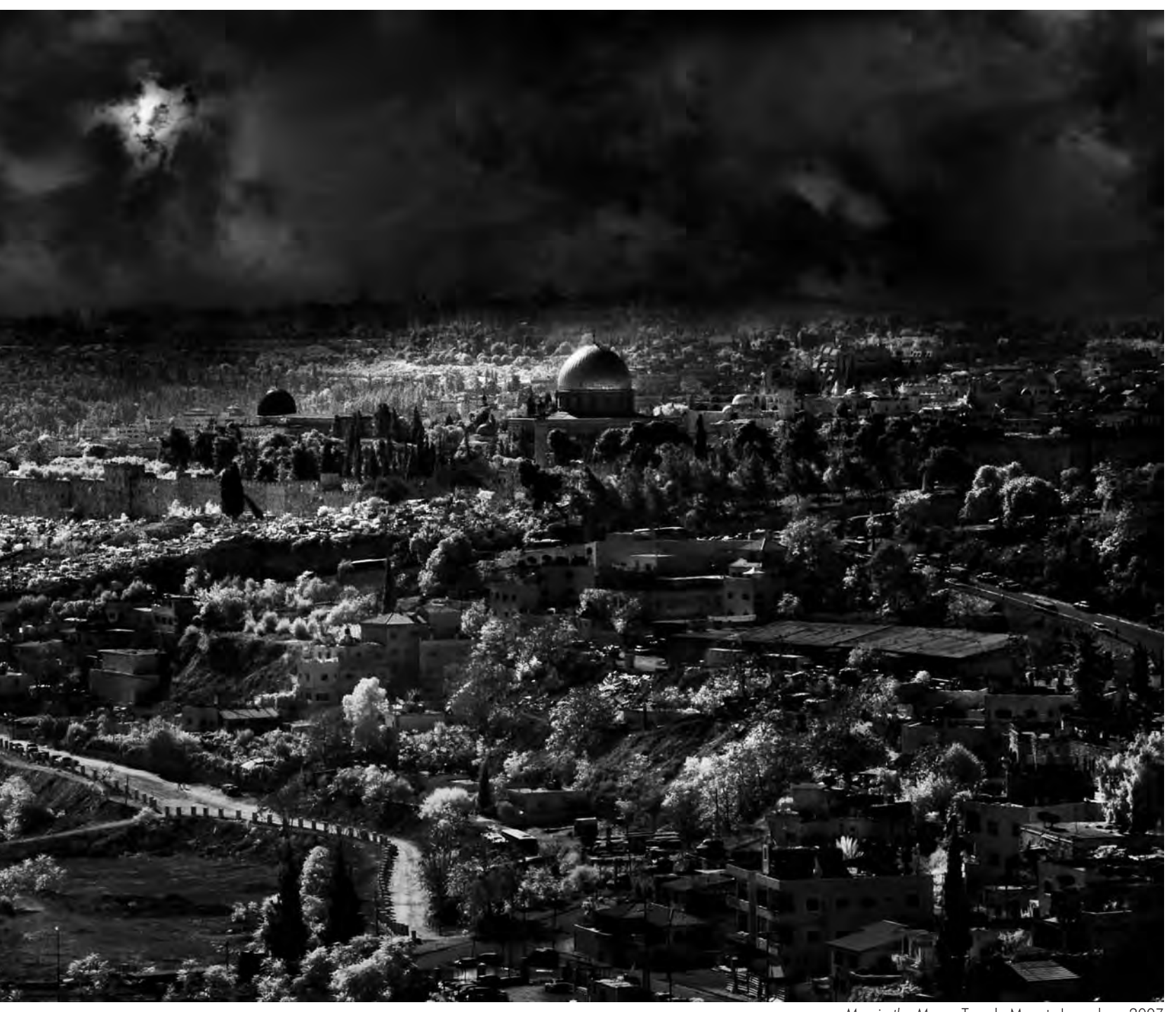
Man in the Moon, Temple Mount, Jerusalem, 2007