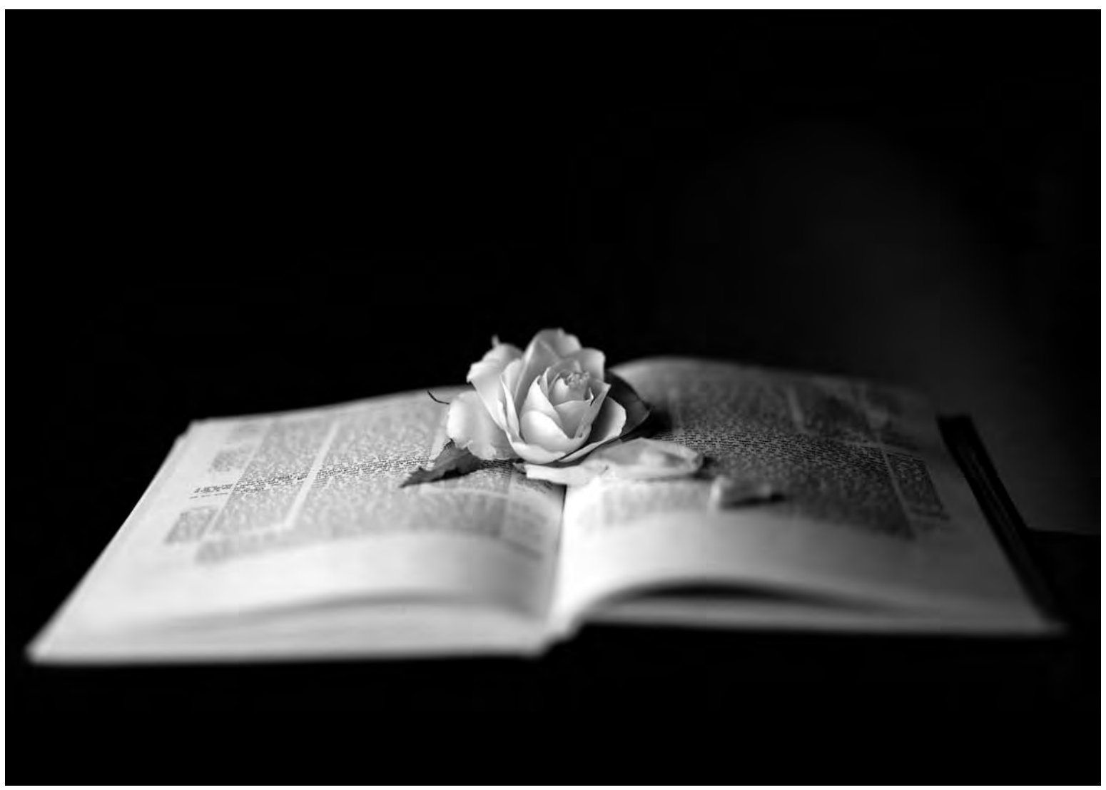
Shoshanat Yaakov, Jerusalem, 2000