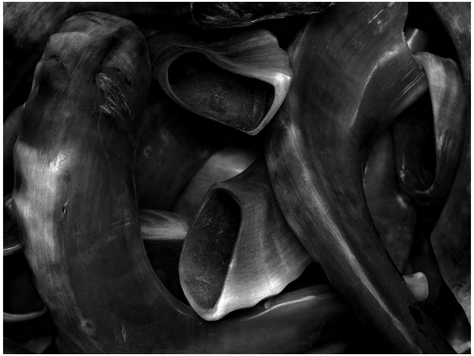
Music from Beyond, 2007