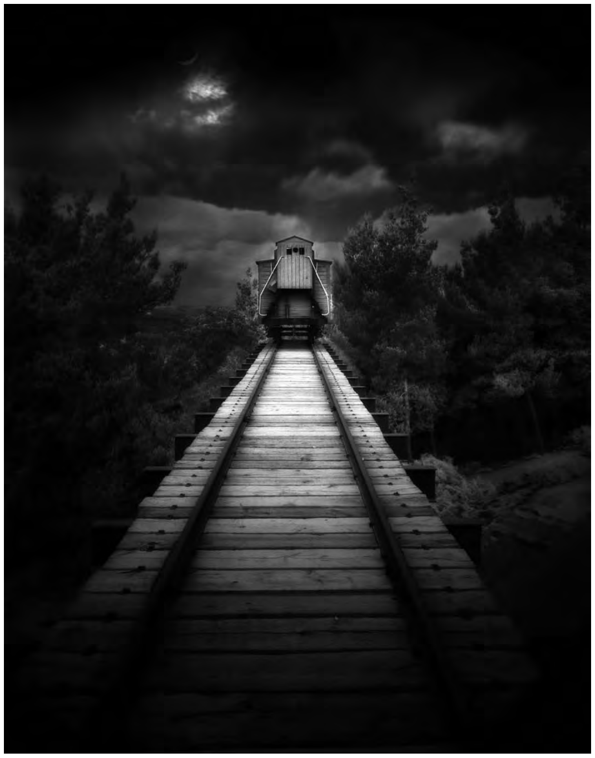
Yad Vashem, Jerusalem, 2004