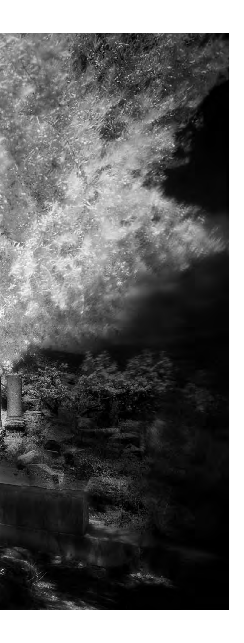
ARIES - THE MONTH OF NISSAN